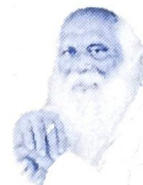
Founder : PADAM. DR. KARMVEER BHAURAO PATIL (D.LIT)